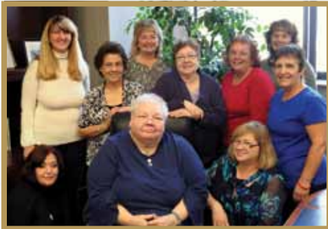
Fuel and Payments staff