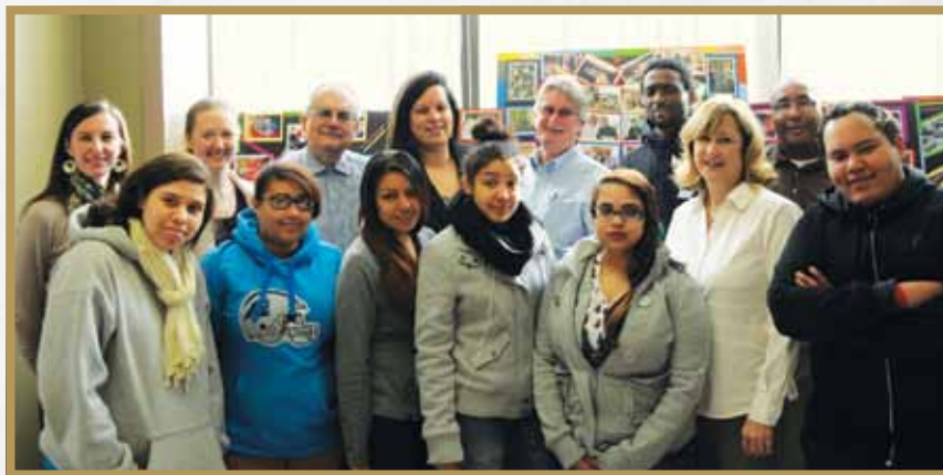
Job-Education students and staff