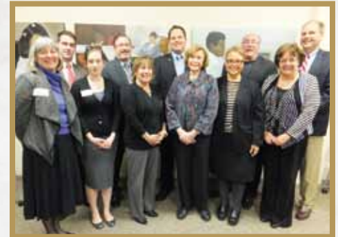
2014 Legislative Breakfast