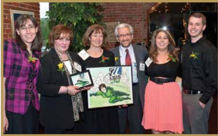
UMass Critical Care Unit Action Heroes