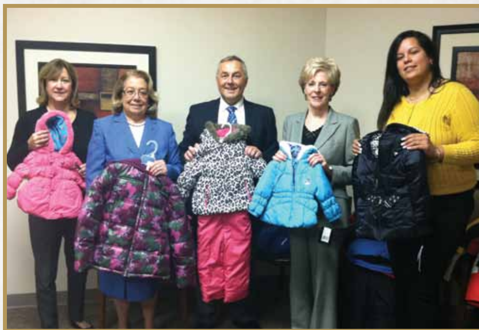
Commerce Bank donates to WCAC Coat Drive