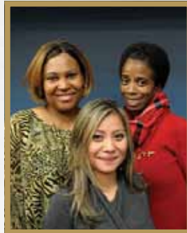
Fuel Intake staff