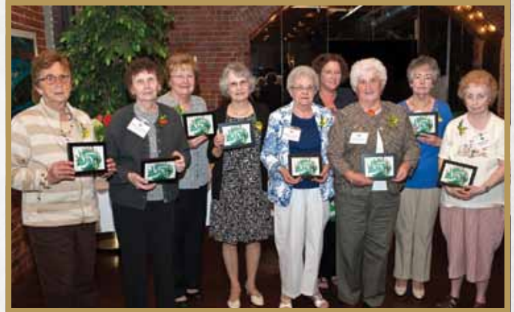
Knit for Fun, Worcester Senior Center, Action Heroes