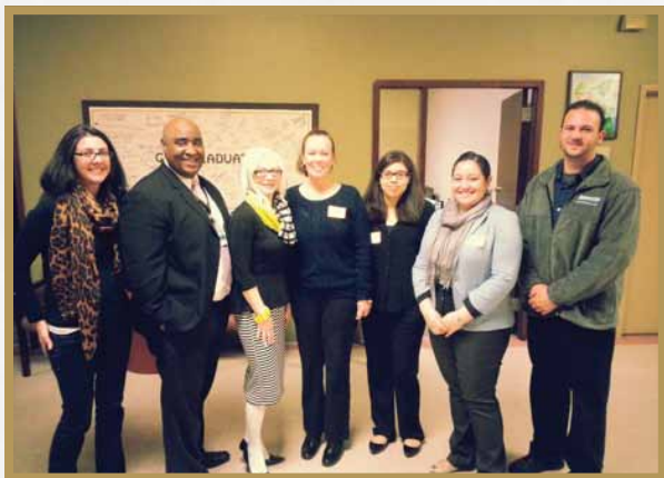
Employers' Business Breakfast

Special thanks to WCAC's Board of Directors for their time and commitment to the agency over the past fiscal year.